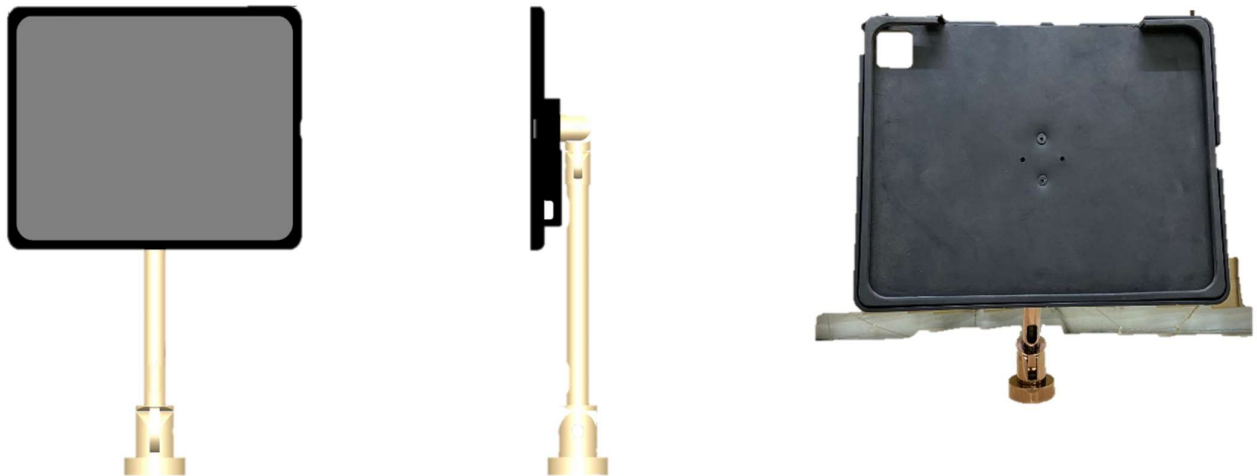
Type 1 Stand: Full Stand Mounting Mechanism

Mounting stand pictures are depicted below as per the specification (Specifications and Dimensions may be changed by MP Vidhan Sabha before Supply of Tablets). Sample Stands will be in display at MPVS during BID. Bidders must ensure to check the details of Stands along with dimensions and all other things. Bidder must ensure that the stands are similar or better (Stand should be approved by MPVS).