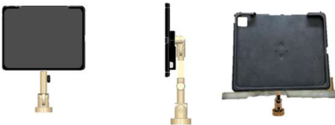
Type 2 Stand: Sliding Stand Mounting Mechanism