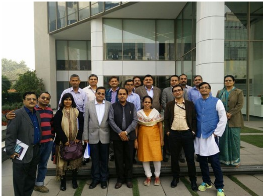
2nd Batch of Participants in Technology Awareness Workshop

The workshop provided detailed insight to the system architecture, planning concepts and various functionalities of these technology along with customer specific solutions. The workshop was attended by approx. 60 officers from Corporate office and all regions.