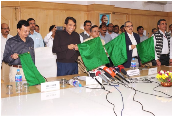
Hon'ble MR flagging off Silchar— Guwahati fast passenger remotely from Railway Board