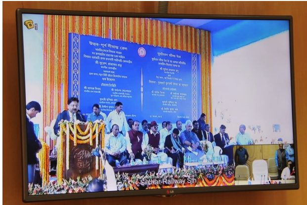
Hon'ble MSR on the stage at Silchar station during the event